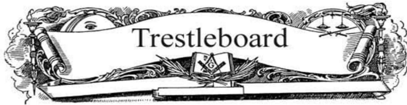
Table Rock Lodge #680 October 2022